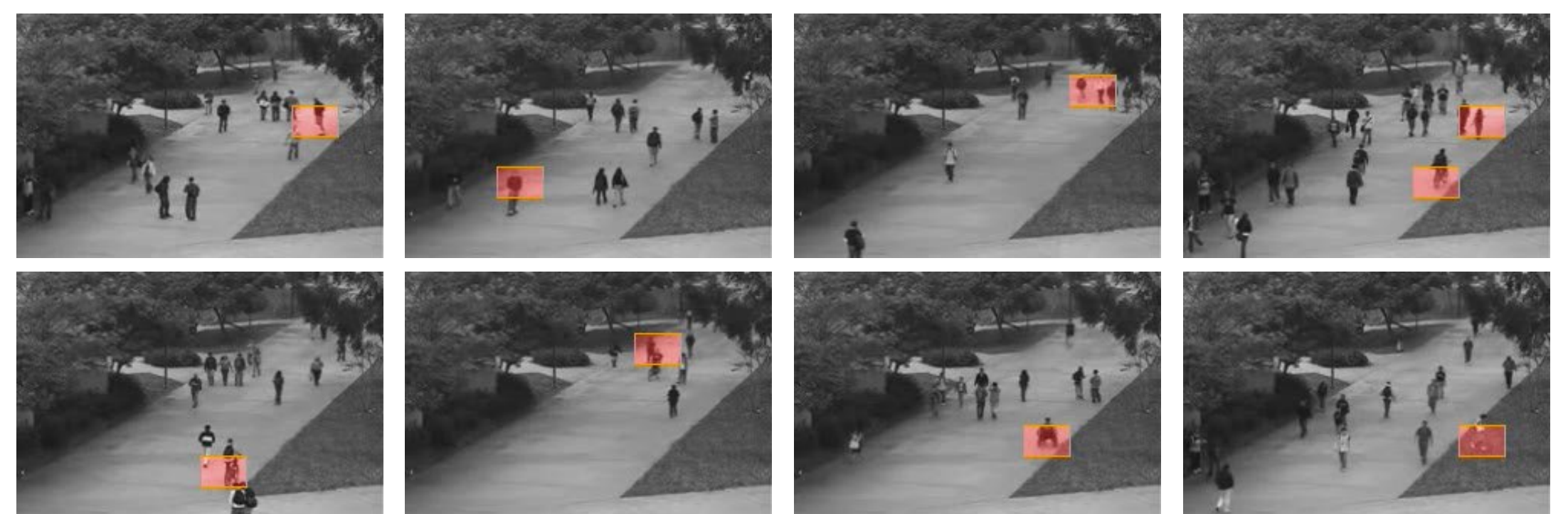
Figure 3: Anomaly detection results on UCSD dataset. Detected anomalies are skaters, bikers and trolleys or vehicles (see Fig. 2). Our system also detects a wheelchair and people walking off the walkway as anomalous patterns.