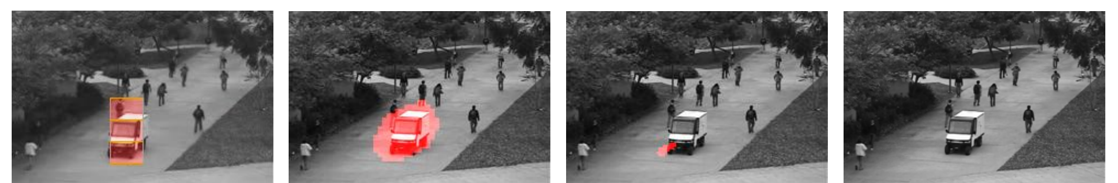
Figure 2: Qualitative comparison with methods presented in [3, 4]: our method, mixture of dynamic textures, social force and mixture of principal components analyzers, social force only.